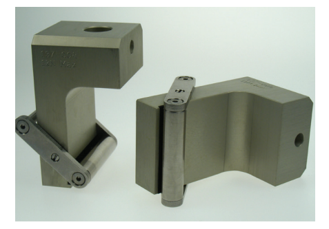
plate to eliminate stress concentration.

Light duty stirrup grip. Specimen is clamped by wrapping between plain self-tightening bollard and backing