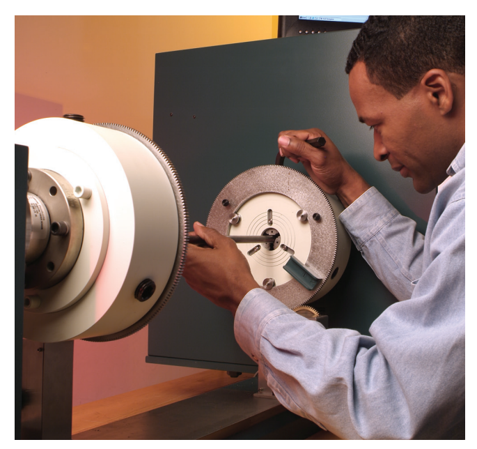
Samples are easily mounted in the patented bidirectional grips.

Specifications subject to change without notice